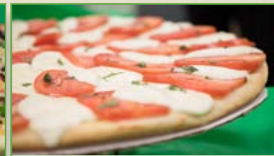
Plum Tomato Mozzarella