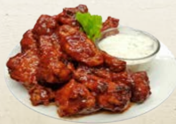
Honey BBQ Wings