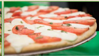
Plum Tomato Mozzarella