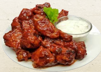
Honey BBQ Wings